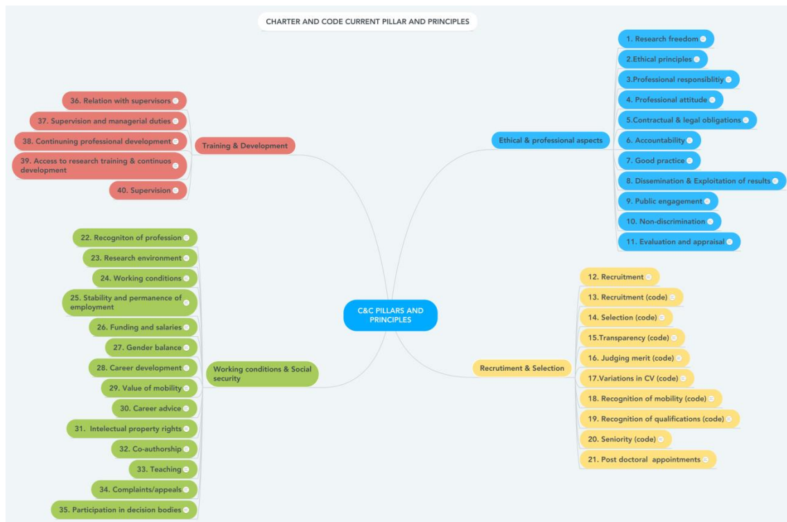
Figure 1. Charter and Code current pillars and principles