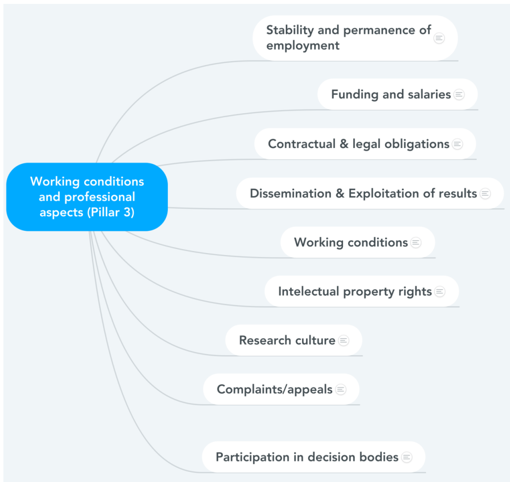
Figure 4. Working conditions and professional aspects.