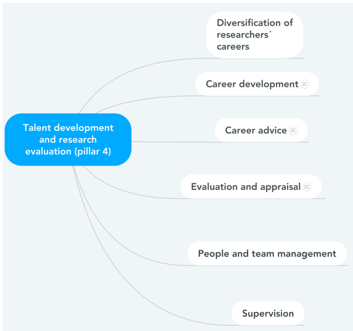
Figure 5. Talent development and research evaluation

The researcher community is diverse in talents, skills, competences and capacities. The more these talents are fostered and developed, the better scientific quality, excellence, and societal relevance of the produced knowledge. Researchers' evaluation is a key tool to foster a researchers' community that makes the most out of everyone's talent. The principles under this pillar aim at contributing to this vision. The "Research and ethical principles" are expected to be mainstreamed in this pillar.